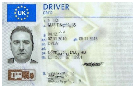
Digital Tachograph Driver Card