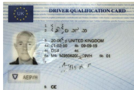
Driver Qualification Card (DQC)